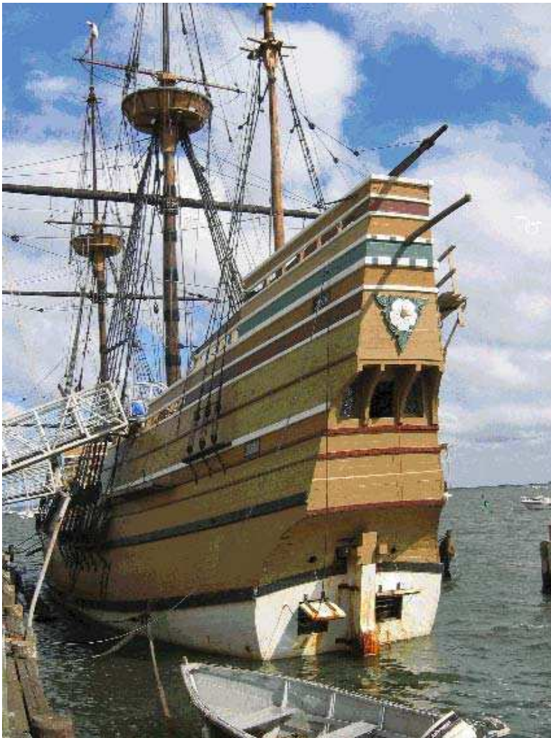
Photo by J. Venrick of the Mayflower II floating at its dock in Plymouth Harbor www.plimoth.org

Thanks Pat for this intriguing article. Also note the link http://www.pgpf.org/newsroom/ and attachment above.