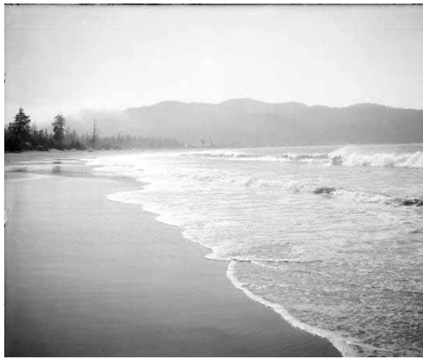
This 1910 Asahel Curtis photograph of Neah Bay shows part of an area within the Makah Reservation.

Although the reservation policy of the 1850s did not require the long-distance moves forced on Eastern tribes, the major objections raised at Stevens' councils related to moves from traditional territories, particularly if it required locating into the lands of tribes towards whom