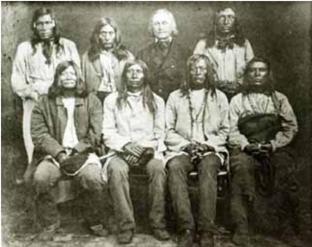
A group of Native Americans from the Upper Columbia is shown here with Father J.P. DeSmet.

one group harbored a certain degree of prejudice if not outright hostility. This issue resulted in the failure of the Gray's Harbor council, prompted Stevens to establish a third reservation (Umatilla) at the Walla Walla council, and created heated debate at the Flathead council. Ultimately some tribes and many individuals covered under the treaties did not move to their designated reservation. For example, only a very few Clallams went to Skokomish; most Nooksacks did not live on the Lummi Reservation, and many Snoqualmie did not reside at Tulalip.