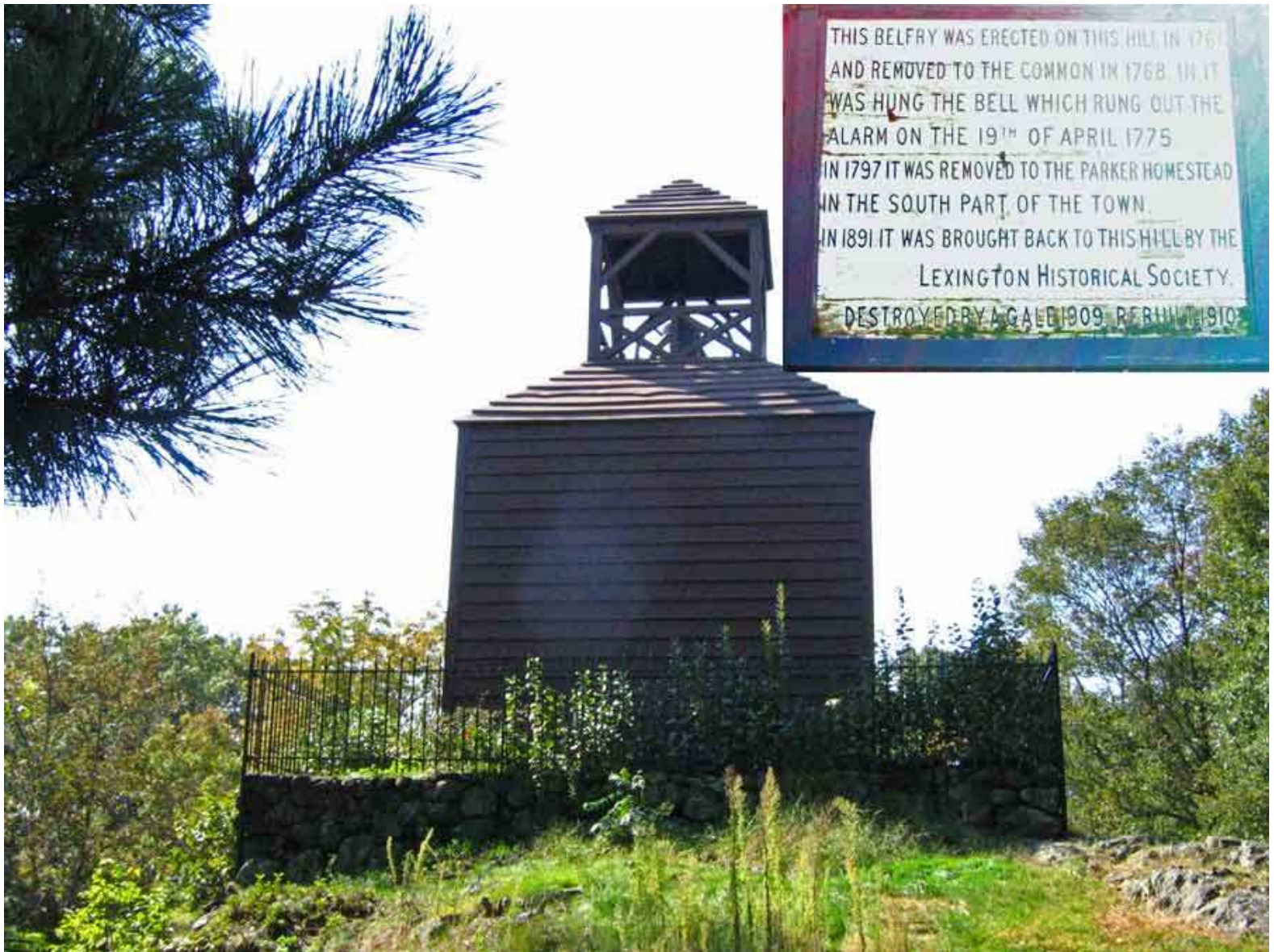
Cannon Digital A80 10-3-2006