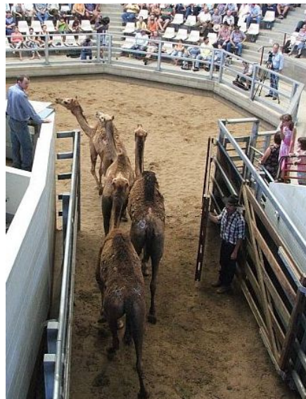
Camel Auction, Australia

Here is the final product from the live camel harvesters: