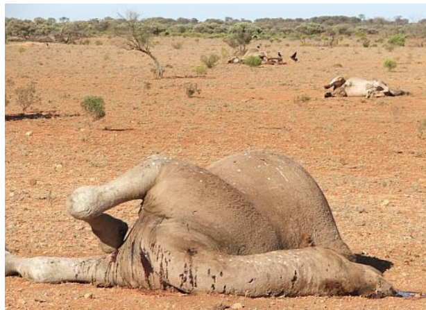
Camel Carcasses, Central Australia.

Does anyone believe that riflemen in helicopters will kill every camel cleanly and painlessly? Yet our whole live export industry is threatened for a few misdeeds. Here is the most likely final product from the carbon credit harvesters: