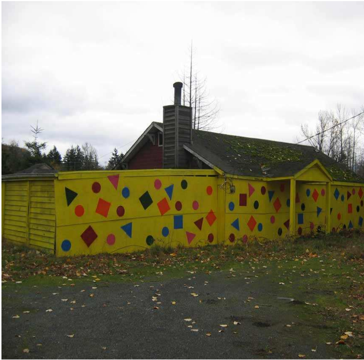
244th Ave SE & SE 464th Enumclaw, Washington, Ole town of Boise, Washington