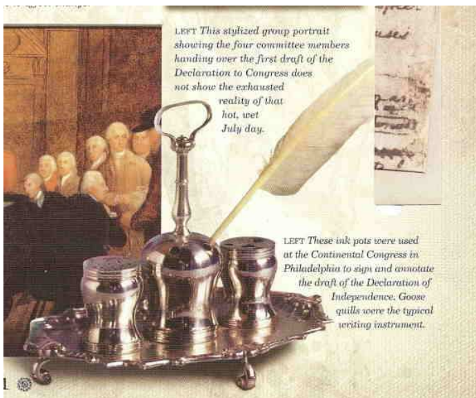
LEFT This stylized group portrait showing the four committee members handing over the first draft of the Declaration to Congress does not show the exhausted reality of that hot, wet July day.

A short list of "Government Crimes Against Property Owners" is shown in the above table. Each line item of taking involves an association (s) who has a stake in taking. The fact that each of these takings goes against sacred natural rights and a Constitutional Republic and the American Revolution is ignored by the entire system. Merely because some greedy municipality and/or association doesn't have to work so hard and long if they can stick it to you. The 6 plus founding and fundamental sources as well as the oaths of all government employees swear to protect these rights under a free and honest Constitutional Republic.