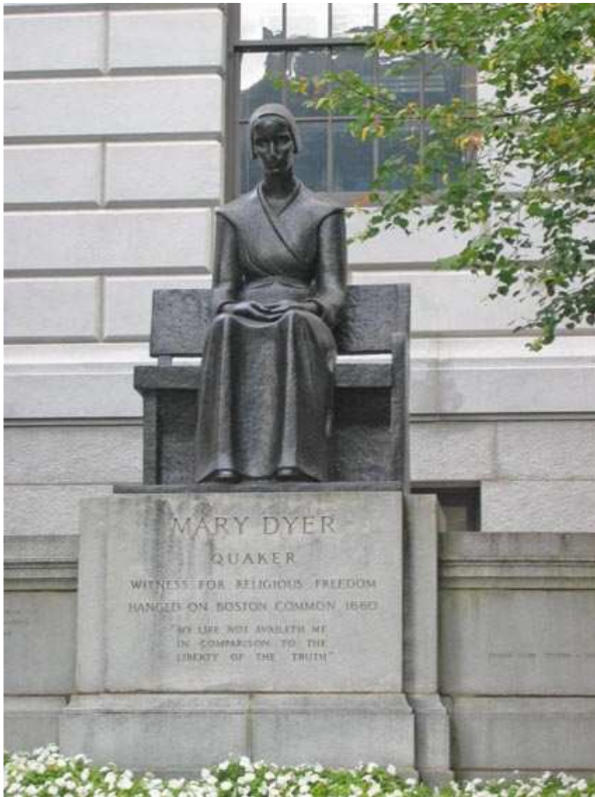
Boston Freedom Trail